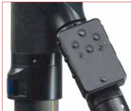
Optional Gimbal with Remote Control. (Shadow™/Shadow™ 50)

Like all our Steadicam stabilizers, the Shadow™ series is designed to be user-friendly, field-serviceable, tool-free, straightforward, and versatile so the operator can quickly and easily configure the rig to the best advantage for each shot. Change the sled length, balance, inertia, and go to low mode in a heartbeat, all without tools, extra parts, or fuss and bother. Solid, versatile, fast, with the Shadow™ series it all happens like magic on the set.