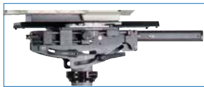
Shown Shadow™/Shadow™ 50

On the stage, the Wide Dovetail Lock has a broader, more positive grip on the dovetail plate, and the handle has a safety stop to prevent accidental release.