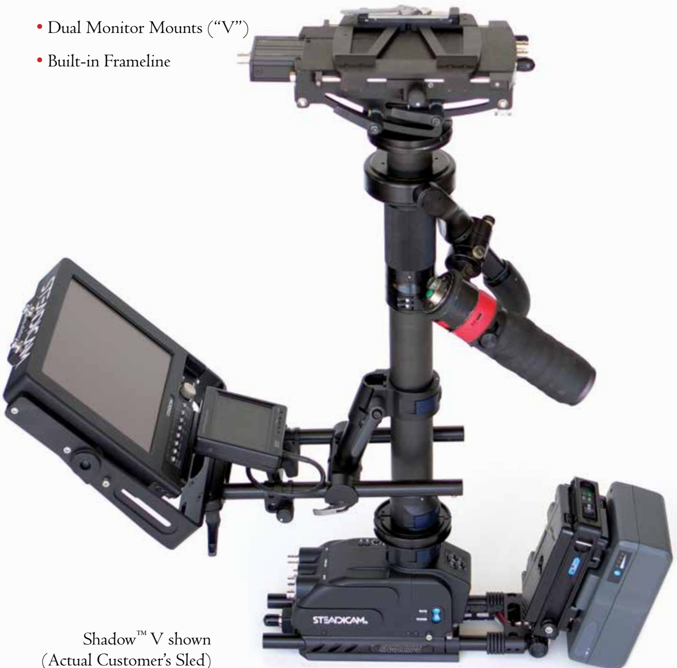
Shadow™ V shown (Actual Customer's Sled)